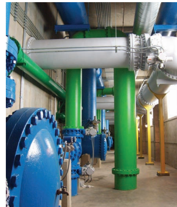
The pipe gallery at the Illinois American Water Champaign water treatment facility.