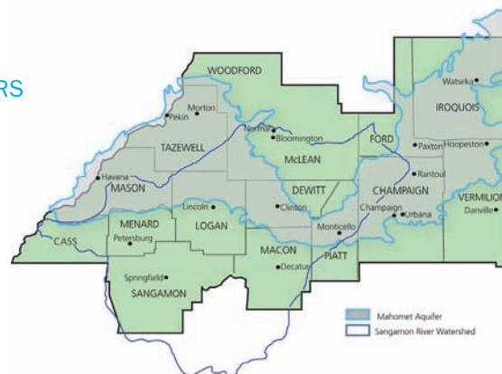
Map courtesy of the Regional Water Supply Planning Council (RWSPC), MPC/Openlands, and the Illinois State Water Survey (ISWS).

The water source for the Champaign County drinking water supply is groundwater coming from wells that tap both the Glasford and Mahomet Aquifers. These aquifers are porous underground formations of sand or gravel that contain water. They were formed when glaciers filled in the riverbed that had previously run through the area.